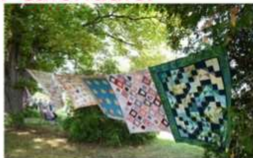
scene from the 2018 Show

9th Annual Clothesline Show & "Garage Sale" July 19 - 20